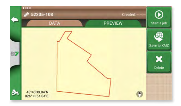
Fields and jobs database